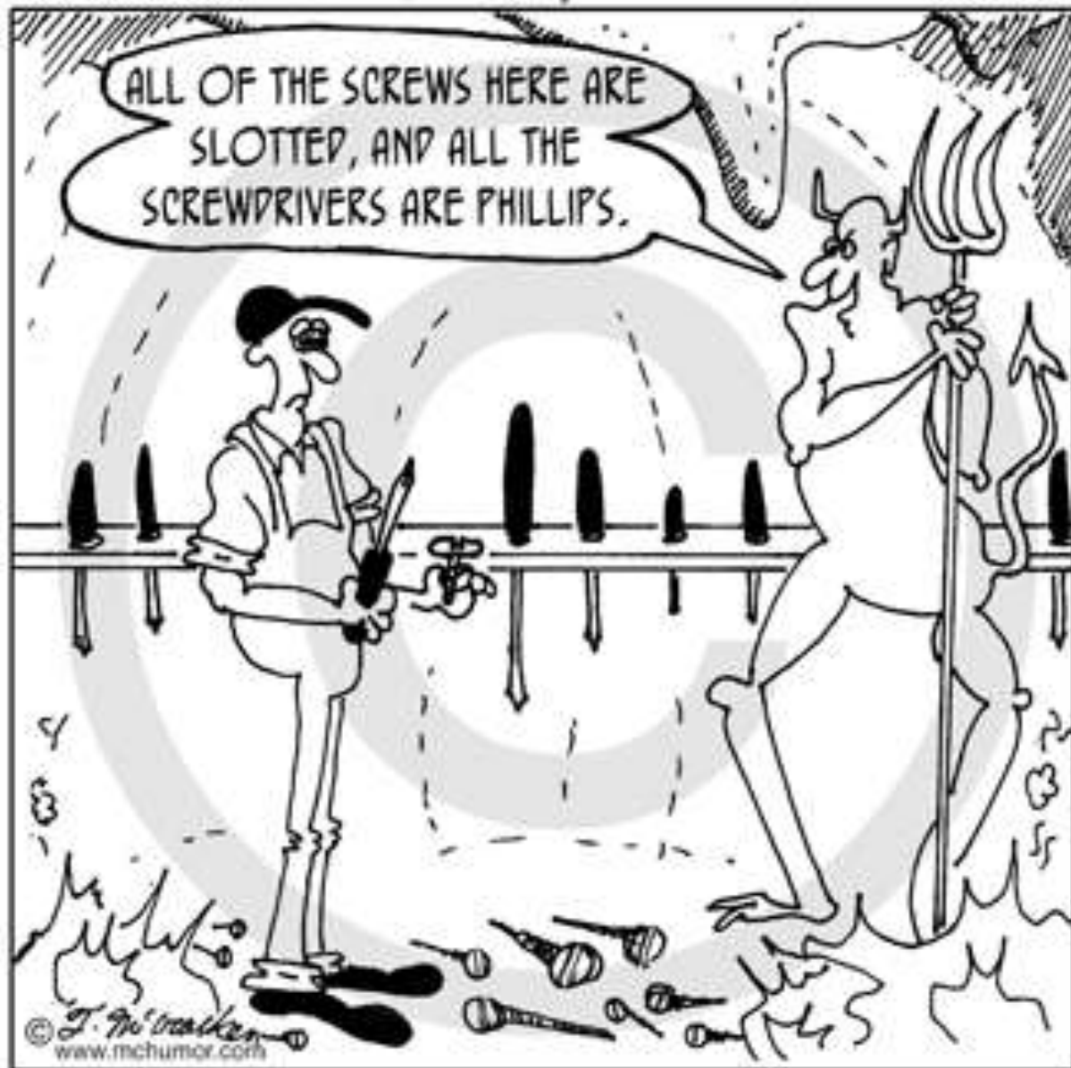
Hell for Mechanics.